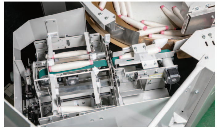
Dual Chute System (D.C.S.)